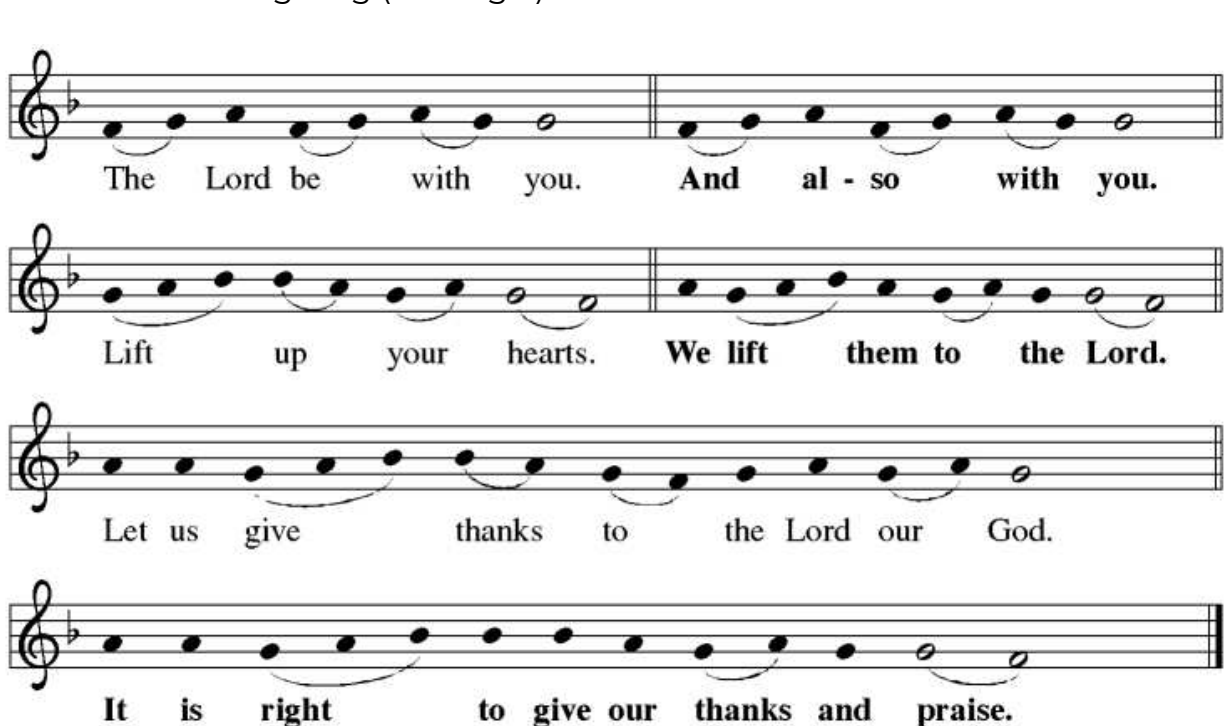
The Preface portion of the Great Thanksgiving follows and is chanted by the presiding pastor.